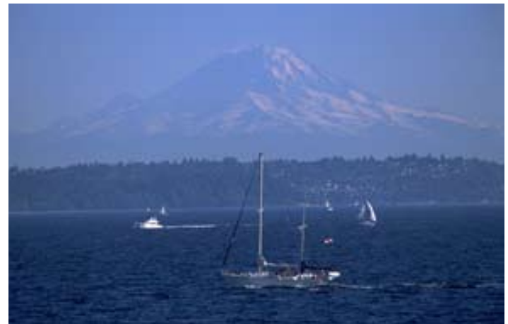
The majestic Mount Rainier watches over pleasure boats on Puget Sound.

For assistance in making your airline reservations call Reward House, Inc, at 877-353-6690 or 816-295-3131 or e-mail jhilburn@rewardhouseinc.com or ktimmerberg@rewardhouseinc.com